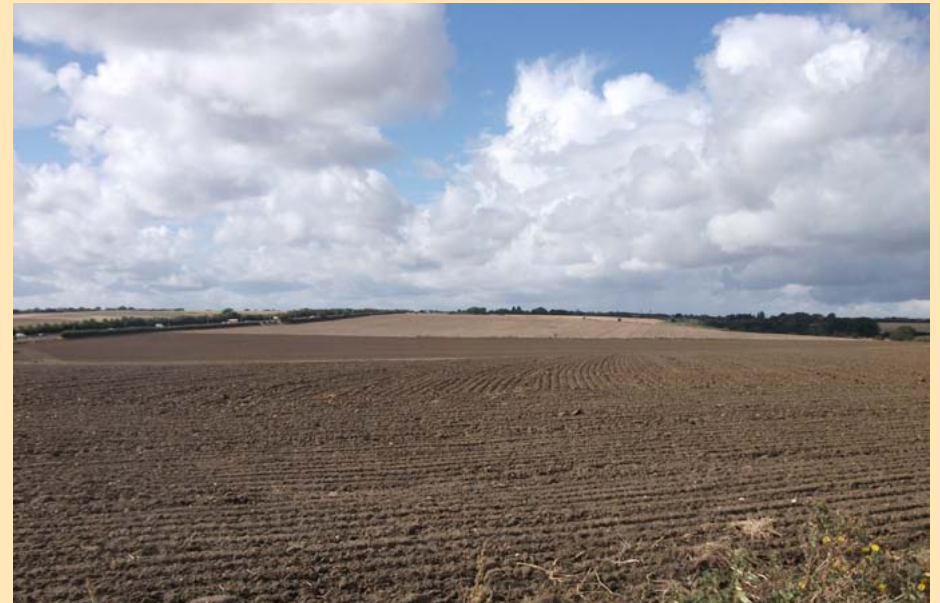
An open, low and gently undulating landscape characterised by high-quality, fertile, loamy soils dominated by agricultural land uses.