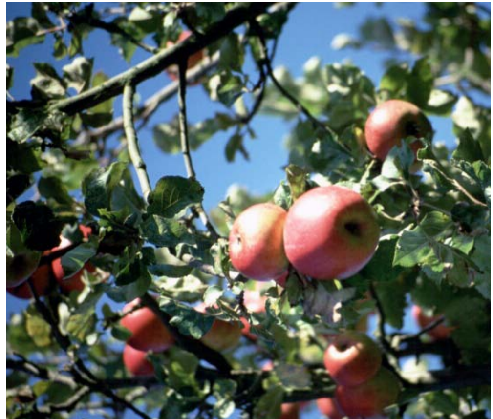
Orchards are a characteristic feature of the North Kent Plain.

Biodiversity and geodiversity are crucial in supporting the full range of ecosystem services provided by this landscape. Wildlife and geologically-rich landscapes are also of cultural value and are included in this section of the analysis. This analysis shows the projected impact of Statements of Environmental Opportunity on the value of nominated ecosystem services within this landscape.