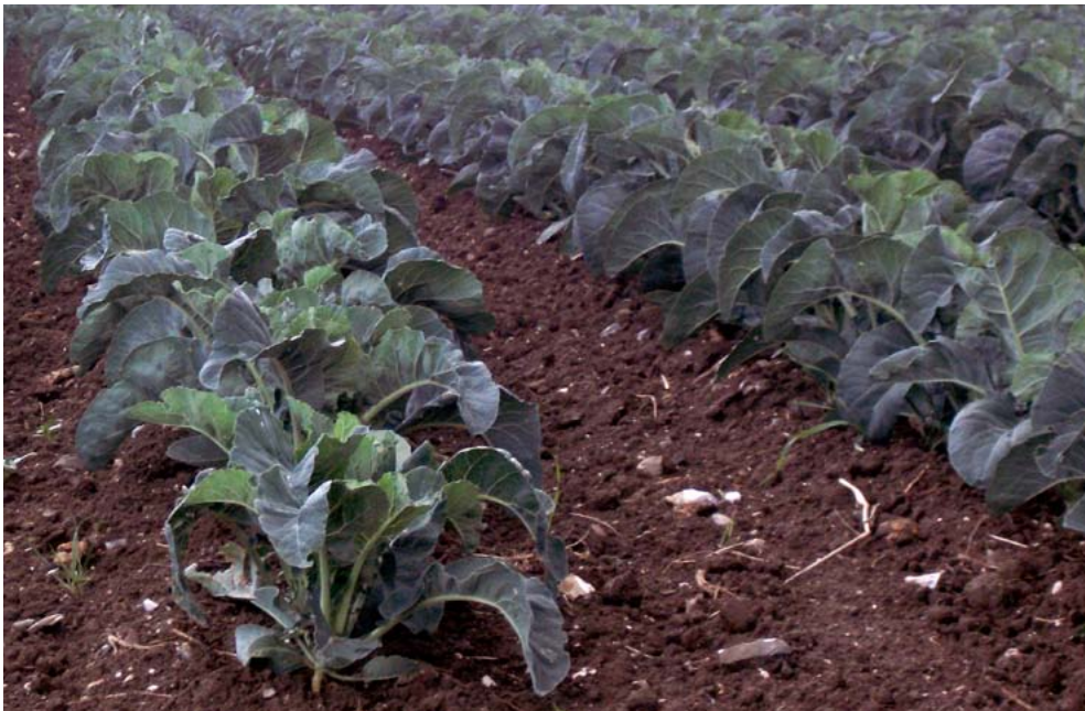
Fertile soils supporting vegetable growing on Thanet.

Lying mainly on fine loam soils, the North Kent Plain is a productive agricultural area of England. With a generally low, gently undulating landform, the landscape is characterised by large, exposed arable and horticultural fields with regular patterns and rectangular shapes. These are predominantly devoid of hedgerows, and there is only limited shelter-belt planting around settlements, farmsteads, orchards and horticultural crops.