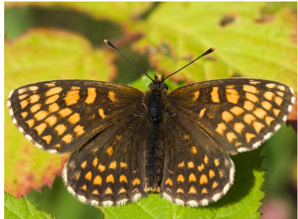
Blean Woods is one of the few areas in Britain that supports the heath fritillary butterfly.