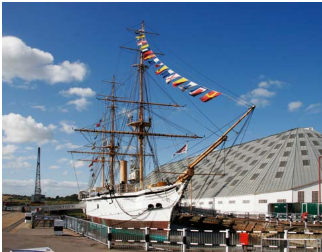
The famous Historic Dockyard at Chatham, now a popular visitor attraction.