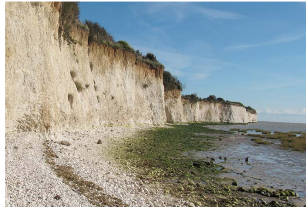
Chalk cliffs at Pegwell Bay are of geological and biodiversity interest. The diverse coastline in this NCA provides good recreational opportunities.