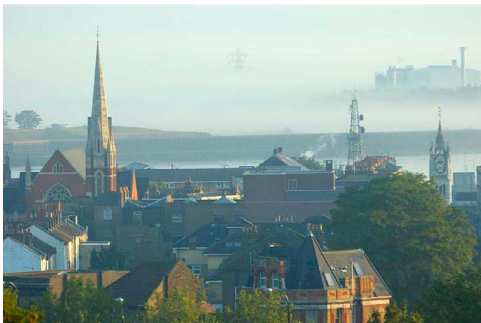
Viewpoint from Windmill Hill in Gravesend, looking towards the Thames.

The table below shows the breakdown of land which is publically accessible in perpetuity: