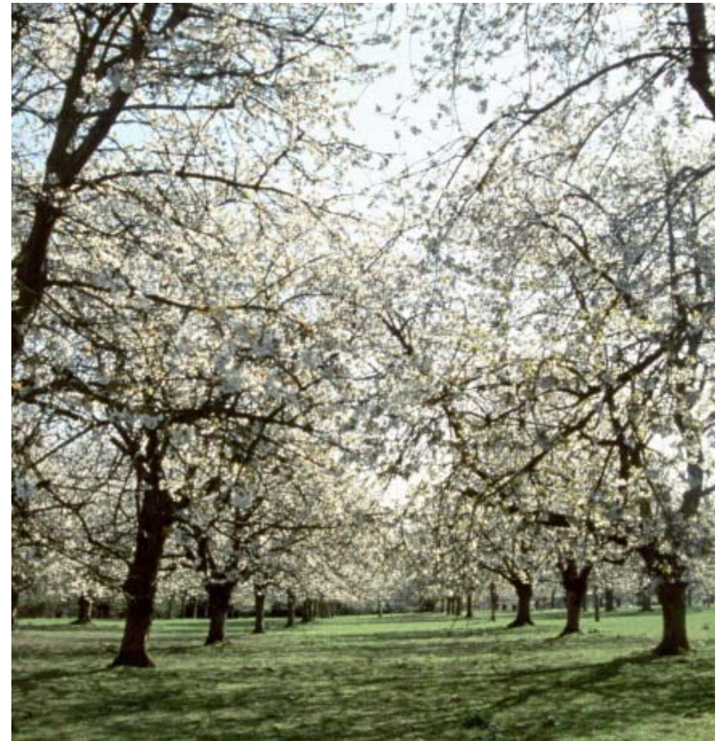
Surviving traditional cherry orchard where management has been funded by Stewardship schemes.