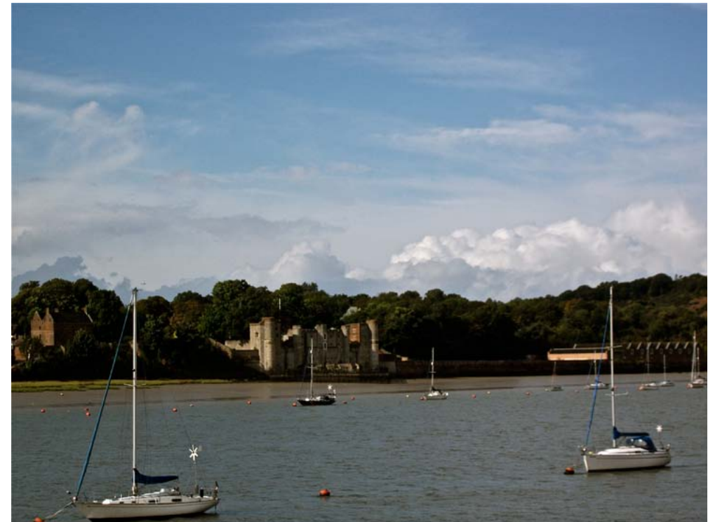
The Medway with Upnor Castle in the background.