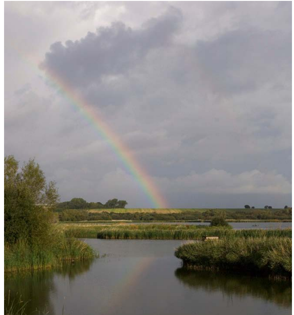
Wetland habitats in the Stour Valley at Stodmarsh National Nature Reserve.